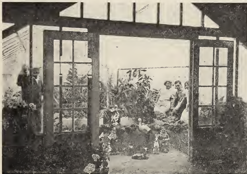
Close-up of the "Family" and the Flowers